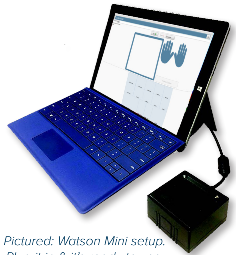
Pictured: Watson Mini setup. Plug it in & it's ready to use.

When AmericanChecked and Accurate Biometrics integrated platforms, two companies clicked together as one unit. Clients enjoy the expanded benefits of two companies, but only have one point-of-contact for questions, one invoice and system to order from, both saving time and money.